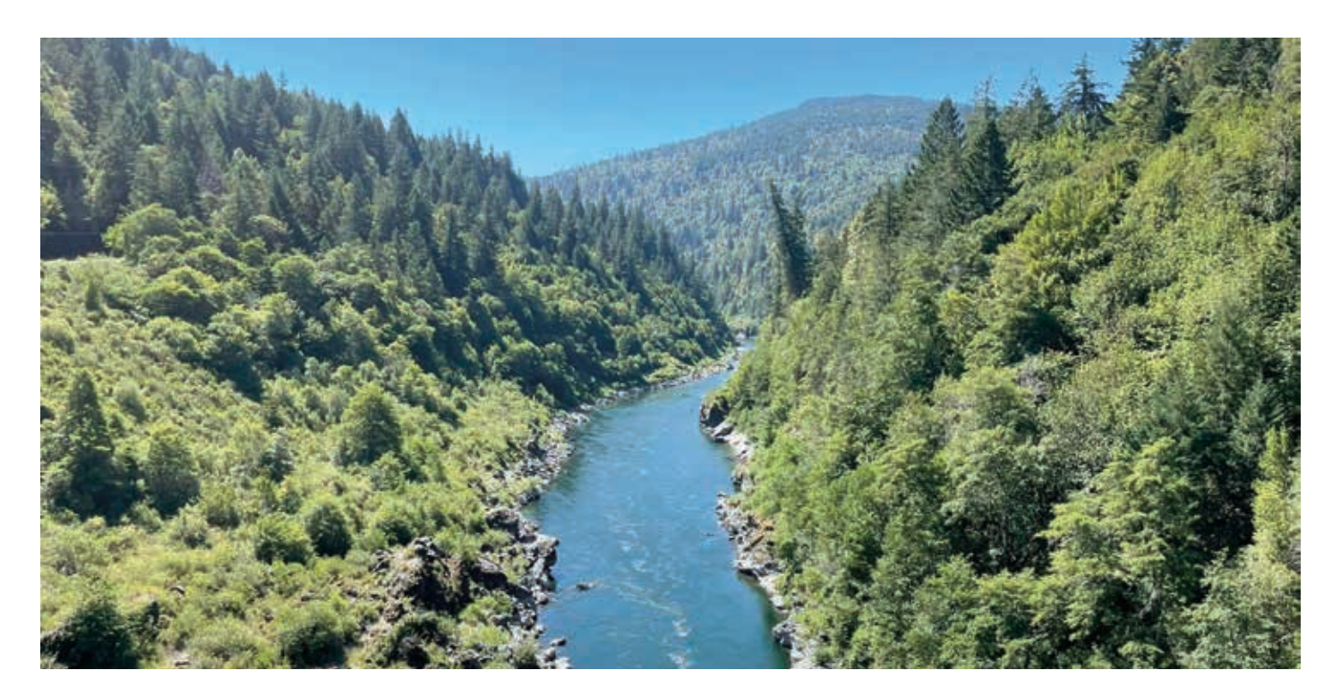
DISPROPORTIONATE HARM | OCTOBER 9, 2023